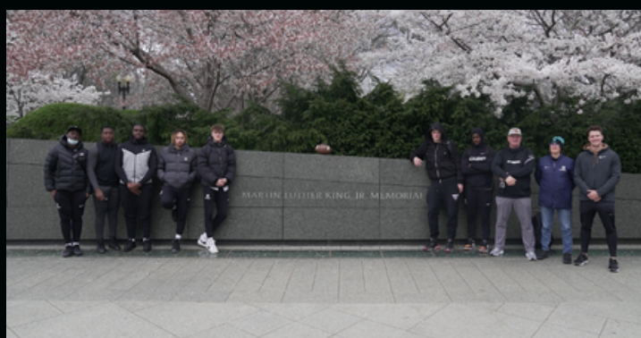
UK Academy 2022 visit to Martin Luther King JR. Memorial