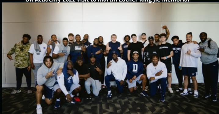
UK Academy 2022 visit to Dallas Cowboys NFL Facility

The USA tours form an important step in the journey as these students develop within the NFL Academy Program. Not only will they provide important life experience to the students, but will also be a critical step toward securing a university scholarship. Competition against their American peers in front of decision makers at universities allows a student from the Asia Pacific region to overcome the barriers of being a prospective international student.