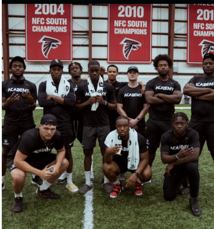
UK Academy 2022 visit to Atlanta Falcons NFL Facility

These visits will consist of a week-long stay with US High Schools and Colleges. Students will practice and compete in football camps alongside their peers, in addition to attending classes and participating in cultural experiences. This will also allow students to tour the facilities, meet with staff and gain an understanding of the admissions process and criteria. The group will also visit nearby monuments and historic sites, as well as visiting NFL team facilities.